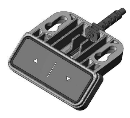
Figure 1: Package contents

The TOUCHbasic cable handswitch package contains: